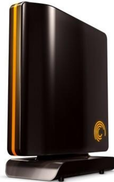
USB External hard drive