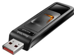
USB Flash Drive also called Pen Drive or Memory Stick