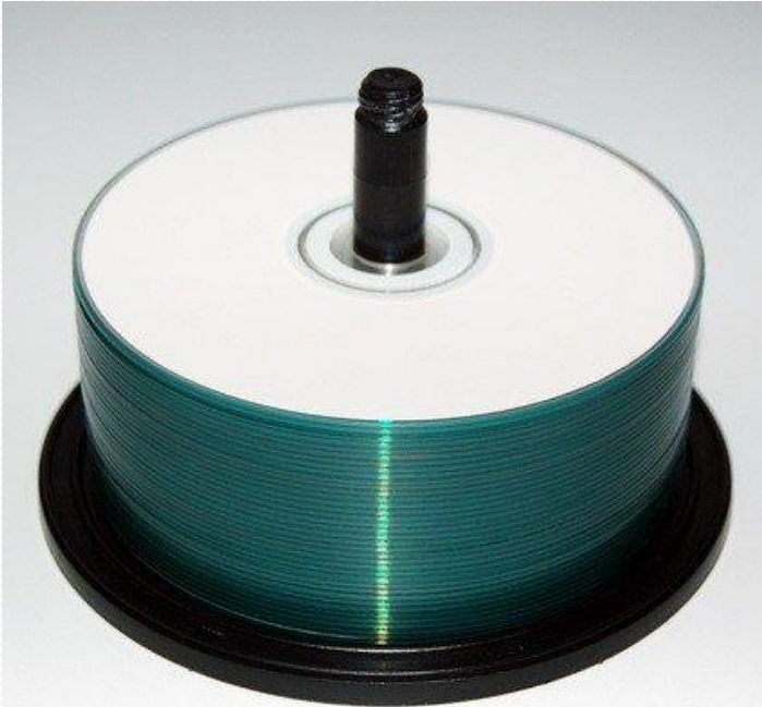
CD or DVD